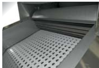
Spreader roll/orienter belt

Atlas Pacific, with over fifty years of experience in the food industry, has fruit processing machines in over 23 countries worldwide. To service these installations, Atlas employs a dedicated team of service technicians, located around the world, ready to assist customers with